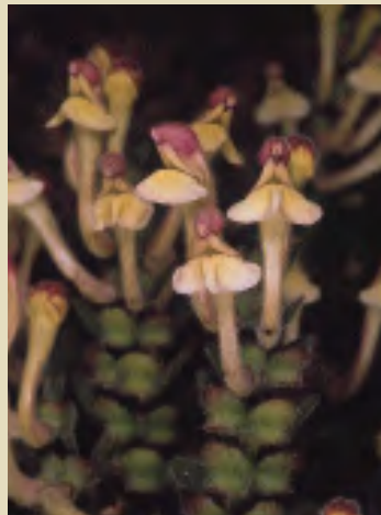
Scutellaria cypria var. cypria

8. TYPICAL DUNITE with orange-brown colour.