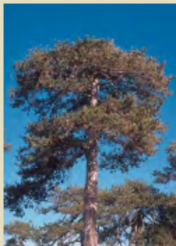
Pinus nigra ssp. pallasiana

9. BARBERRY Berberis cretica . It appears in interdependence with black pine.