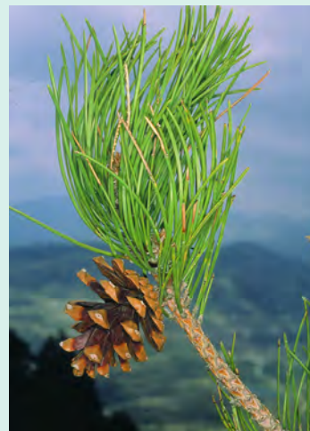
Pinus nigra ssp. pallasiana