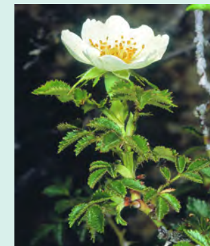
Rosa canina var. dumetorum